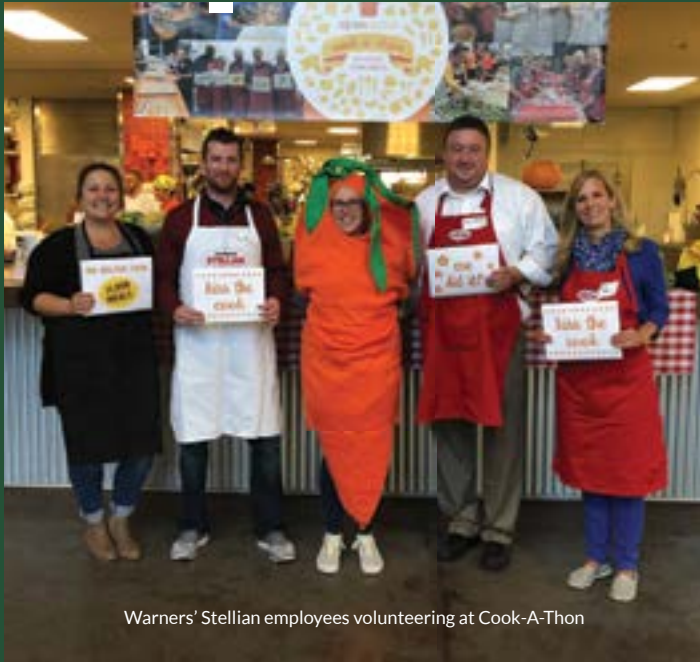
Warners' Stellian employees volunteering at Cook-A-Thon